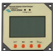
Remote display for BlueSolar DUO 12/24-20