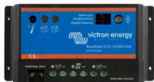
BlueSolar PWM-DUO 12/24-20